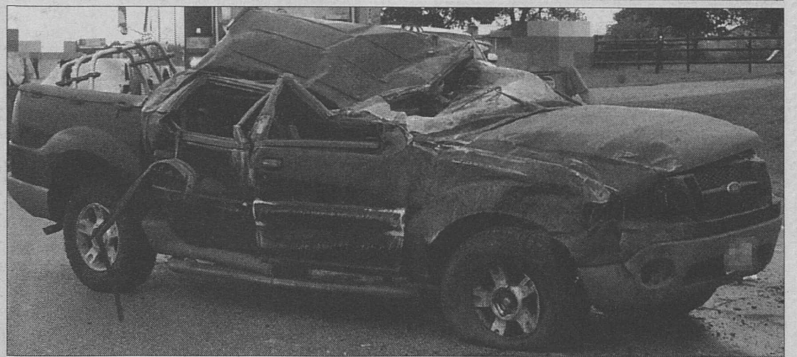
Pictured above is the pickup in which two individuals lost their lives on Friday afternoon on I-10 near Columbus.

To Order: Call This Newspaper direct, or call Texas Press Service at 1-800-749-4793 Today!