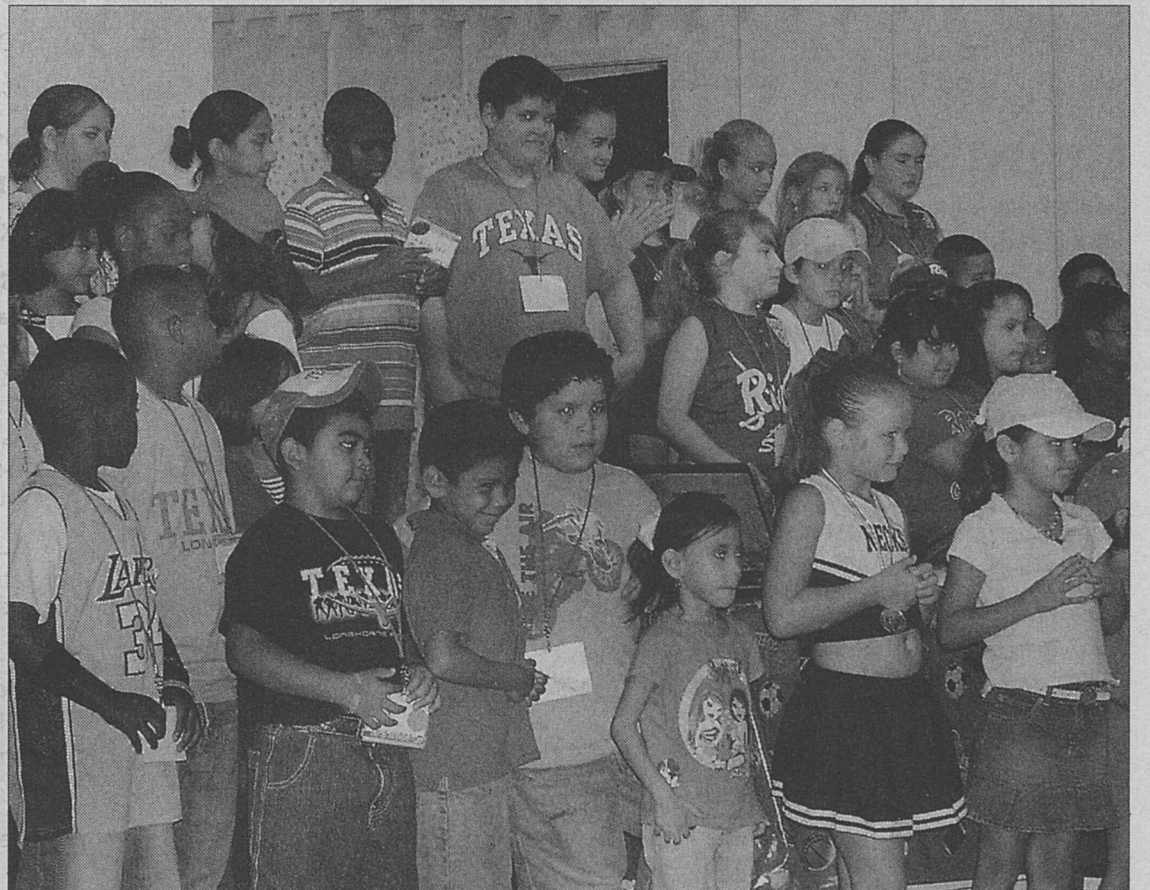
Pictured above are just a few of the many children who attended Vacation Bible School at the First Baptist Church last week. A "Game Day Central" Family Night was held at 6 p.m. Friday, July 20. The ceremony was followed with cookies and punch in the fellowship hall of the church.

The Congressman updated county representatives on House consideration of the Agricultural Appropriations bill, which will include implementation of country-of-origin labeling for beef, sought by many area cattlemen. He also discussed provisions of the new 2007 Farm Bill as well as his sponsorship of the Social Security Fairness Act to eliminate the Government Pension Offset, which disadvantages many retired teachers and federal employees. In addition to Colorado County, Doggett also represents Hays, Fayette, Gonzales, Travis, Bastrop, Lavaca and Caldwell counties.